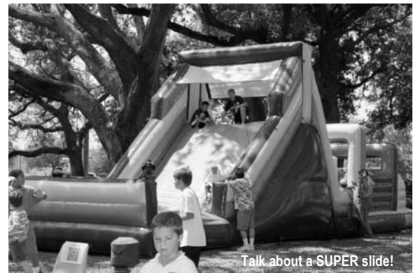
Talk about a SUPER slide!