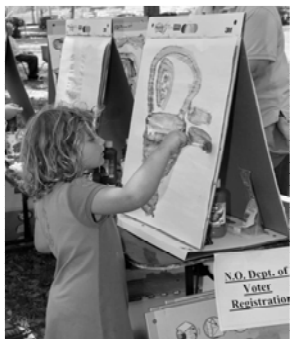
Kids paint works of art