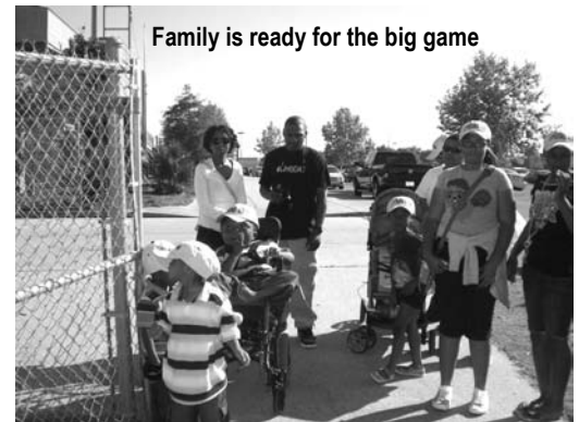
Family is ready for the big game