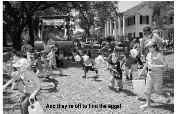
And they're off to find the eggs!