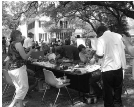
Face painting by the NO Dept. of Voter Registration, is a big hit