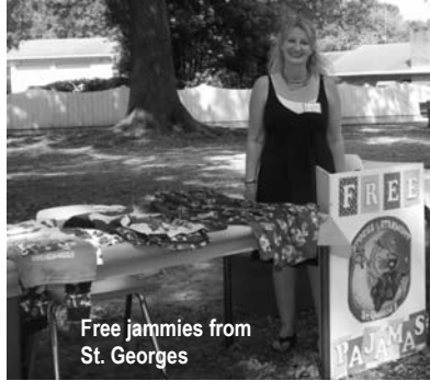
Free jammies from St. Georges