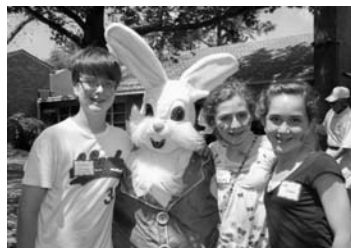
Looks like Mr. Bunny was giving out kisses