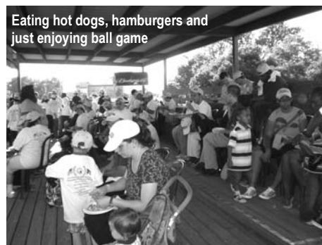
Eating hot dogs, hamburgers and just enjoying ball game