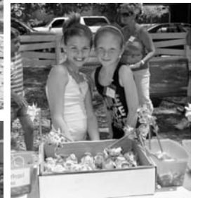
St. Matthew the Apostle Students help build Baskets and play games