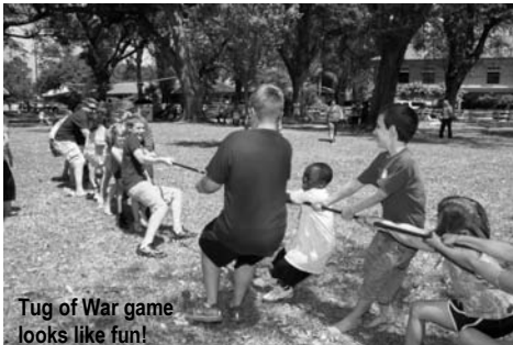
Tug of War game looks like fun!