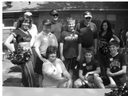
Thank you Kiwanis Clubs, Brother Martin Students & Voodoo Cheerleaders